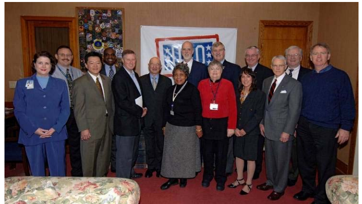
USO Board members, staff and volunteers join Boeing representatives at the January 22 presentation ceremony.