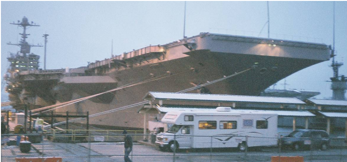
Aircraft Carrier USS Stennis (CVN-74) dwarfs the USO Mobile Canteen. The crew had already boarded by daybreak.

On January 16 th it was quite a sight to see the USO Mobile Canteen emerge out of the snow and pre-dawn darkness with a police escort to pier side (flashing lights and all), followed by the media trucks. (The TV crews came to our side of the street for coffee but after they had already done their broadcast.) The photos do not do justice to the wet and snowy conditions since they were taken after the sun had come up and the thaw had started...like about 8am once everyone was aboard. We had been on station for 3 hours by that time.